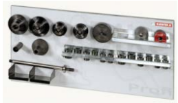
Monolever wheels centering kit+shaft (19mm) Part number: 1695 654 060