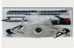
Basic motorbike wheel centering kit (14mm) Part number: 1695 654 039