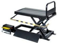
Wheel lift Part number: 1695 900 004