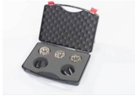
DuoExpert System (3 collets in a case 54-78mm) Part number: 1695 656 698