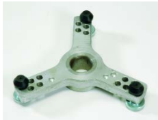
Three arm flange for light trucks