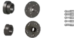
Special centering kit for BMW Part number: 1695 656 822 OEM