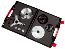
Kit demo box for truck