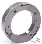
Distance ring with magnets for Off-Road cone from the back incl. Pins (40 mm) Part number: 1695 655 316