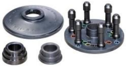
Special centering kit for GM/OPEL Part number: 1695 655 323 OEM