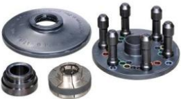
Special centering kit for GM/OPEL Expert Part number: 1695 655 324 OEM