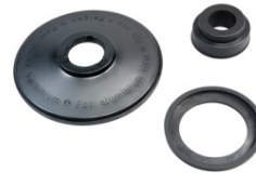
Special centering kit for Daimler/Smart Part number: 1695 655 326 OEM