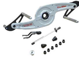
ECO motorbike wheel centering kit (14mm) Part number: 1695 654 718