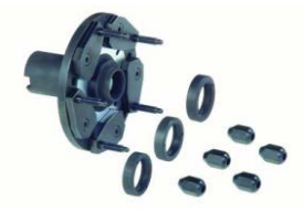
3-4-5 hole Flange Part number: 1695 654 043