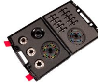
Kit Duo Expert with pressure plates Part number: 1695 656 570