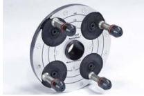
QuickPlate 4-holes with standard heads Part number: 1695 655 295