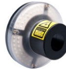
Light ring and laser pointer Part number: 1695 654 994 In the “L” version SBM V765 includes it in the SoD