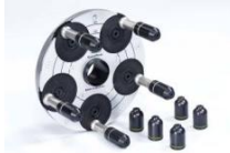
QuickPlate 5-holes with standard heads Part number: 1695 655 296