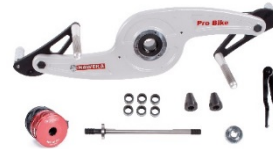
BMW centering kit Part number: 1695 000 259